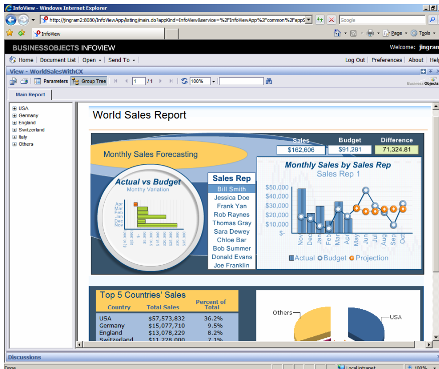
Figure 1: InfoView Interactive Report