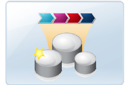
Clean Master Data